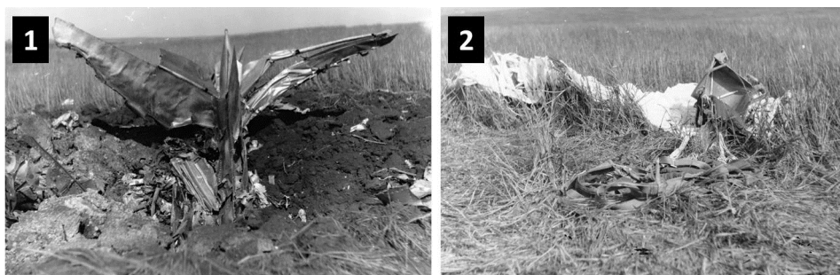
Fig. 1 The MiG-15 disaster – June 16 th , 1958: (1) tailplane debris, (2) KK-1 type ejection seat [17]

A total of 38 AAs recorded as disasters (see Fig. 1 for an example) associated with the ejection of one or two crew members were tracked down (see Tab. 1). A total of 45 crew members were involved, out of which 41 attempted to eject (4 successfully and survived, 37 unsuccessfully and were killed). The remaining 4 crew members never even attempted to eject and were killed in the cockpit.